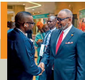
Daily networking breaks