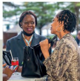
VIP cocktail receptions