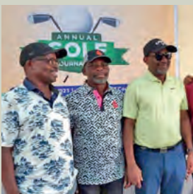
PETAN golf day

“SAIPEC enables networking, partnership formation, and business development, leading to potential investment opportunities and collaborations that can advance the industry growth and competitiveness.